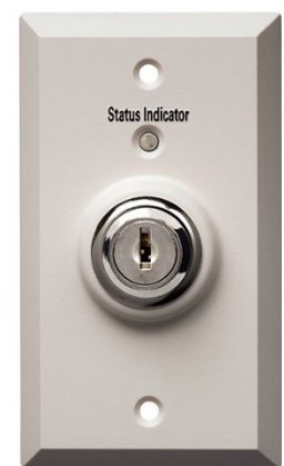
Model TSM-1X Duct Detector Test Switch

Model TSM-1X provides intelligent built-in, dual isolation, meeting Class X (Style 7) survivability requirements for shorts while providing reliable alarm communication to the Siemens FACP. Additionally, Model TSM-1X allows up to 190 isolators per loop, and up to 30 devices between isolators (wired in polarity insensitive mode). The devices between isolators can either be pre-existing `H'-series or later `X' generation devices.